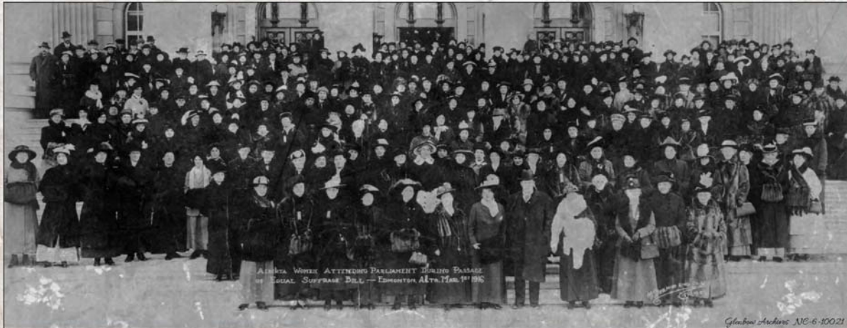
Women visitors at Legislature Wednesday afternoon to hear debate on equal suffrage bill - March 1 st , 1916